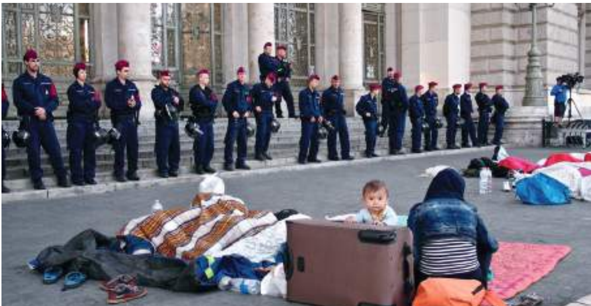
Refugees in Budapest.

Climate change and migration are intersecting realities for millions of people millions of people who live in cities across the world. Cities, city networks, and policy experts are increasingly applying diverse solutions to the broad range of challenges posed by these phenomena. However, rapid rates of urbanization and widening inequalities continue to strain the physical and social infrastructure of cities, increasing the vulnerability and exposure of local communities to climate risks (Figure 1). Cities are thus both “sites of increased exposure to risks” 6 and actors of urban governance that advance local solutions to global challenges.