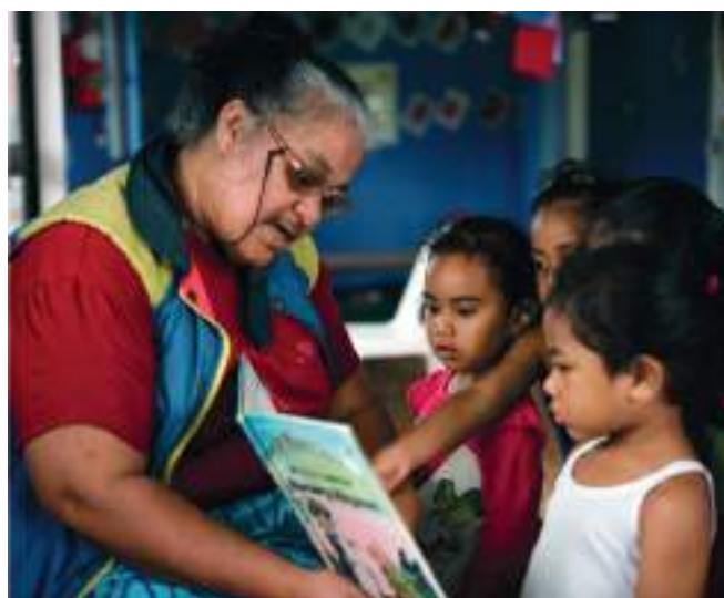
Displaced by Children displaced by sea level rise at a care center in Auckland.

To address these pressing challenges and welcome migrants with an open heart, Braga heavily relies on its international and regional networks. To promote the integration of migrants into the economy, the city has implemented a project with support from the European Union, which seeks to encourage a mutual recognition of different cultures, uniting local and migrant populations. 45 The national legislation for the acquisition of work permits and residence cards have liberalized over the last thirteen years, making it more accessible. At the local level, the municipality has a Parish council with representatives from Brazil, Ukraine, and other countries. These representatives play a key role in providing migrant communities with housing, food, and support with immigration paperwork. Migrant children are encouraged to pursue education in local schools. Promoting inclusion of cultures, schools offer language classes and recruit teachers who speak the native language of migrants. Gouveia remarked that language promotes a “strong connection” amongst migrants, especially the “Brazilian Brothers” who also speak Portuguese. Lastly, underscoring the need for city-to-city learning, Hélder Costa emphasized the “need for politicians to talk to each other, for city professionals to connect with and learn from each other, and share best practices.” Overall, Braga employs multiple methods in a holistic effort to integrate migrants into their “intercultural” city. 46