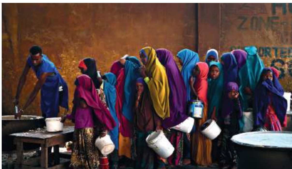
Young Somali girls line up for porridge at a feeding center in Mogadishu.

Additionally, the shifting definitions of climate migrants and refugees, who are often excluded from legal frameworks for migration, pose challenges for cities to support those displaced or seek asylum due to climate change. 38 Along these lines, ActionAid International observes that “in the scenario of worsening climate impacts, maintaining the strict differentiation between ‘refugees’, ‘economic migrants’ and ‘climate migrants’ may become increasingly impossible.” 39 With climate-related migration projected to increase in the coming decades, policies on climate migration will prove more important, and perhaps more contentious, than ever. This observation is supported in the findings from interviews with city officials, as will be discussed in the next section of this report. Ultimately, an integrated and comprehensive policy response is necessary to address the interconnected issues of climate change and migration.