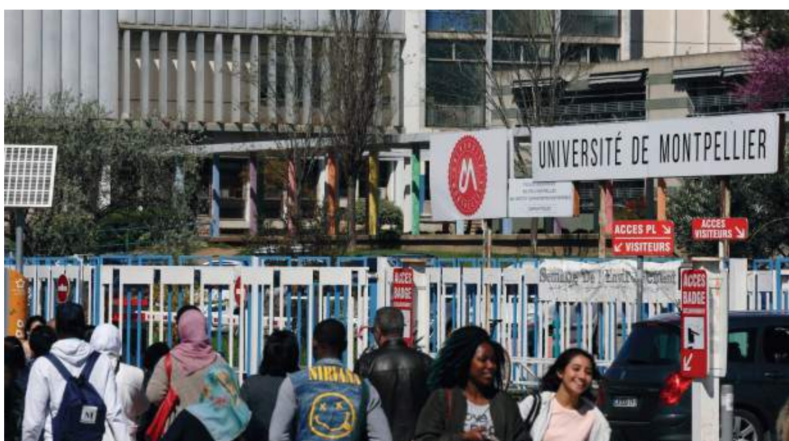
University of Montpellier.

Montpellier's integration policy continues to seek further development. The city's coordinated integration policies have been able to address the rapid influx of refugees of the war in Ukraine and other crises. Montpellier is a member of Cités Unies France 49 and plays a key role in the networks' working group on migration, through which city leadership transfers best practices and policies to cities that are less prepared for migrant influxes. However, Montpellier could benefit from the strengthening of national and local policy frameworks. Further knowledge transfer could fulfill the need to enhance the city's capacities for the emergency construction of prefabricated housing. Additionally, France currently has no specific asylum status for climate refugees, a legal shortcoming that could hinder Montpellier's integration processes in the future. Nonetheless, Montpellier's intercultural heritage and integration policy has equipped city leadership for future global challenges.