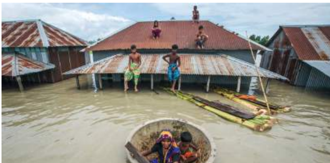
Floods in the Ganga-Brahmaputra basin.

The 2021 Global Report on Internal Displacement estimates that over 30 million people are internally displaced by weather-related extreme events in 2020, with storms and floods standing out as the most common drivers. 13 Regionally, the most severe disaster-related displacements were experienced in East Asia and the Pacific, and South Asia, where about 21 million people were displaced. Small island states in the Caribbean and South Pacific are disproportionately affected by the impacts of climate change, particularly due to rising sea levels.