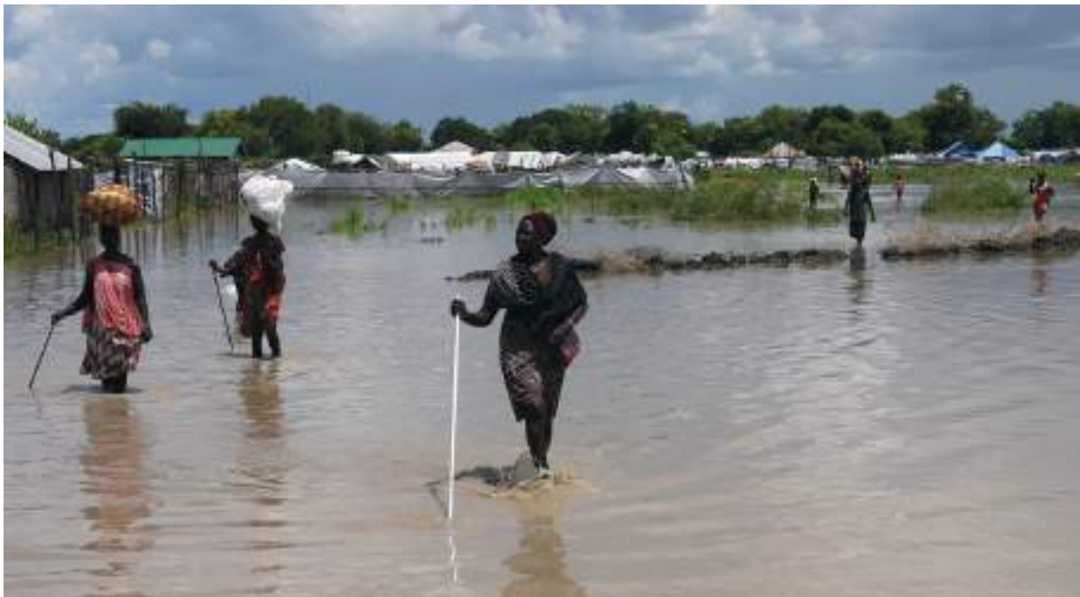
Floods in South Sudan.

Housing more than 53,000 people, Iganga is a municipality in the Busoga region in eastern Uganda. Landlocked and located ninety miles north of Lake Victoria, the city has a tropical climate and receives rainfall even in its driest months. Iganga experiences both seasonal and permanent migration. 43 The municipality welcomes migrants from conflict-ridden regions of Kenya, Sudan, and the Democratic Republic of Congo. Many migrants and their families have been forced to move to Uganda due to unstable economies and precarious living conditions in their countries of origin. Within Uganda, people from rural parts of drought-stricken northern regions move to Iganga in pursuit of food, water, jobs, and pastures for their cattle.